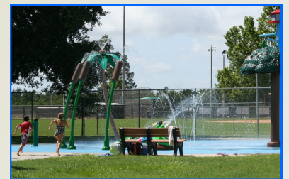
Chris Lyle Aquatic Center Splash Pad