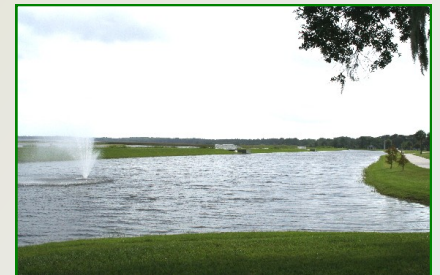
St. Cloud Lakefront