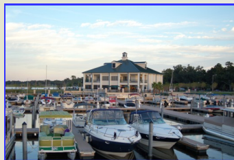
St. Cloud Marina