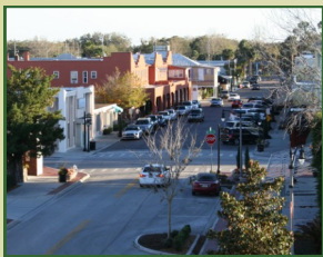
Downtown St. Cloud