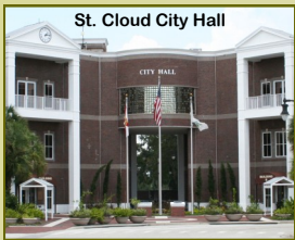
St. Cloud City Hall

The city’s slogan is “Celebrating Small-Town Life”